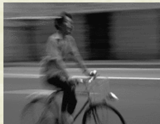
Life passes by fast...Are you ready?

wheels have fallen off, then either replace them with a new set or hook-up with someone who can give you a lift—tow