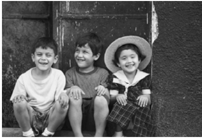
Taking care of you so that you may take care of them.