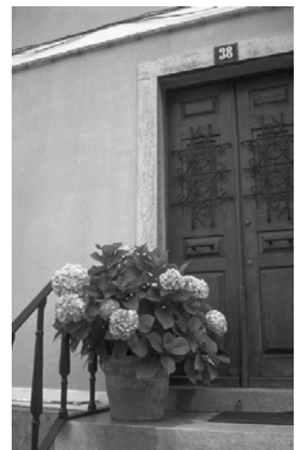
Praying can cause closed doors to become open.